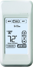
Portable Comfort Control™

Allows users to remotely monitor and control their heating and cooling systems anytime, anywhere. Free apps are available for both Apple® and Android™ devices.