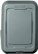
Wireless Outdoor Air Sensor